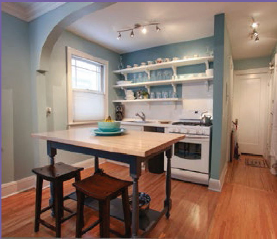
Kitchen Remodel - Classic

Add a 108 sf 18-by-6-foot addition to kitchen and dining room over a crawlspace. Includes: