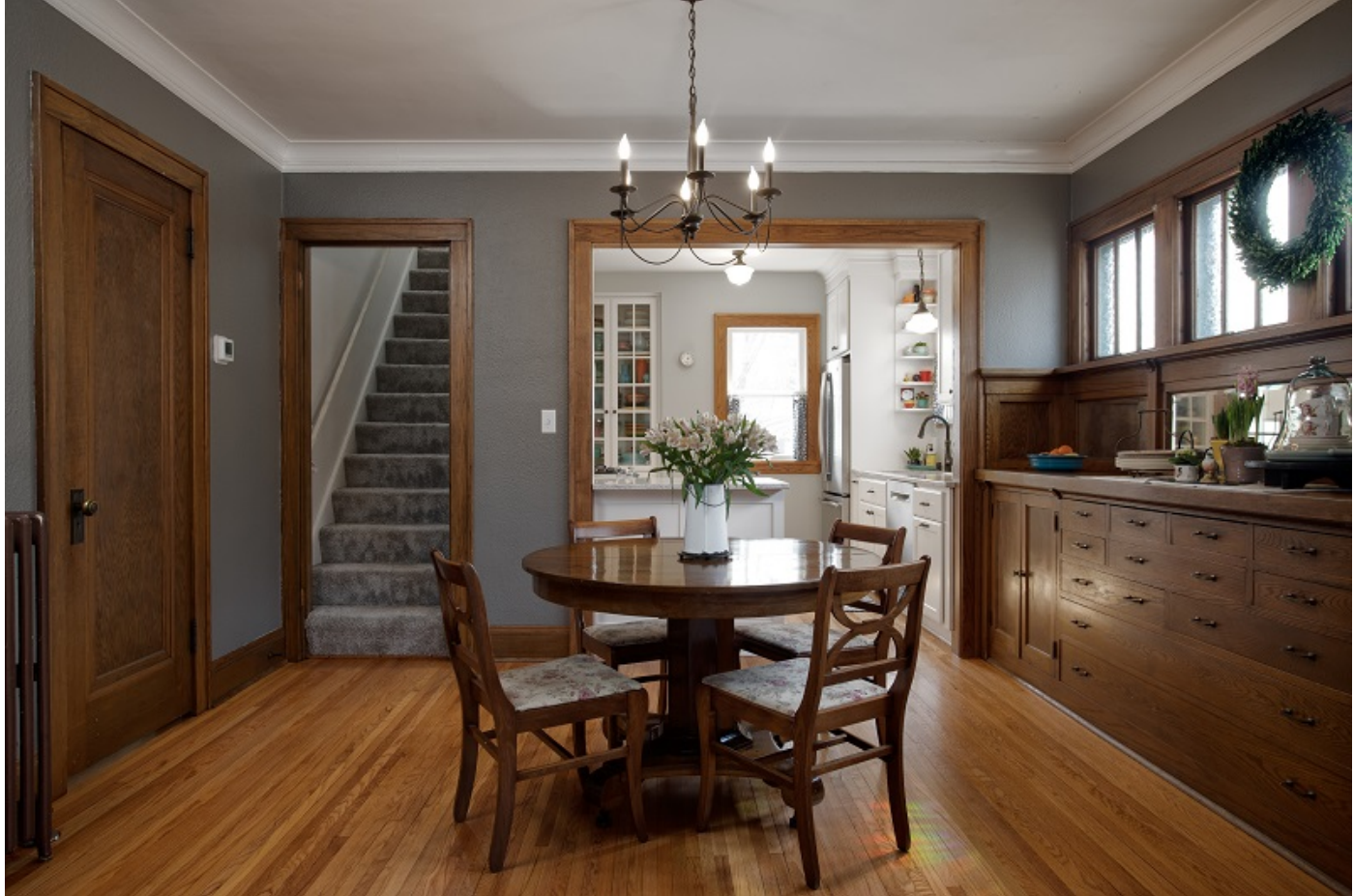
A small back addition was completed to extend the mudroom space and storage.