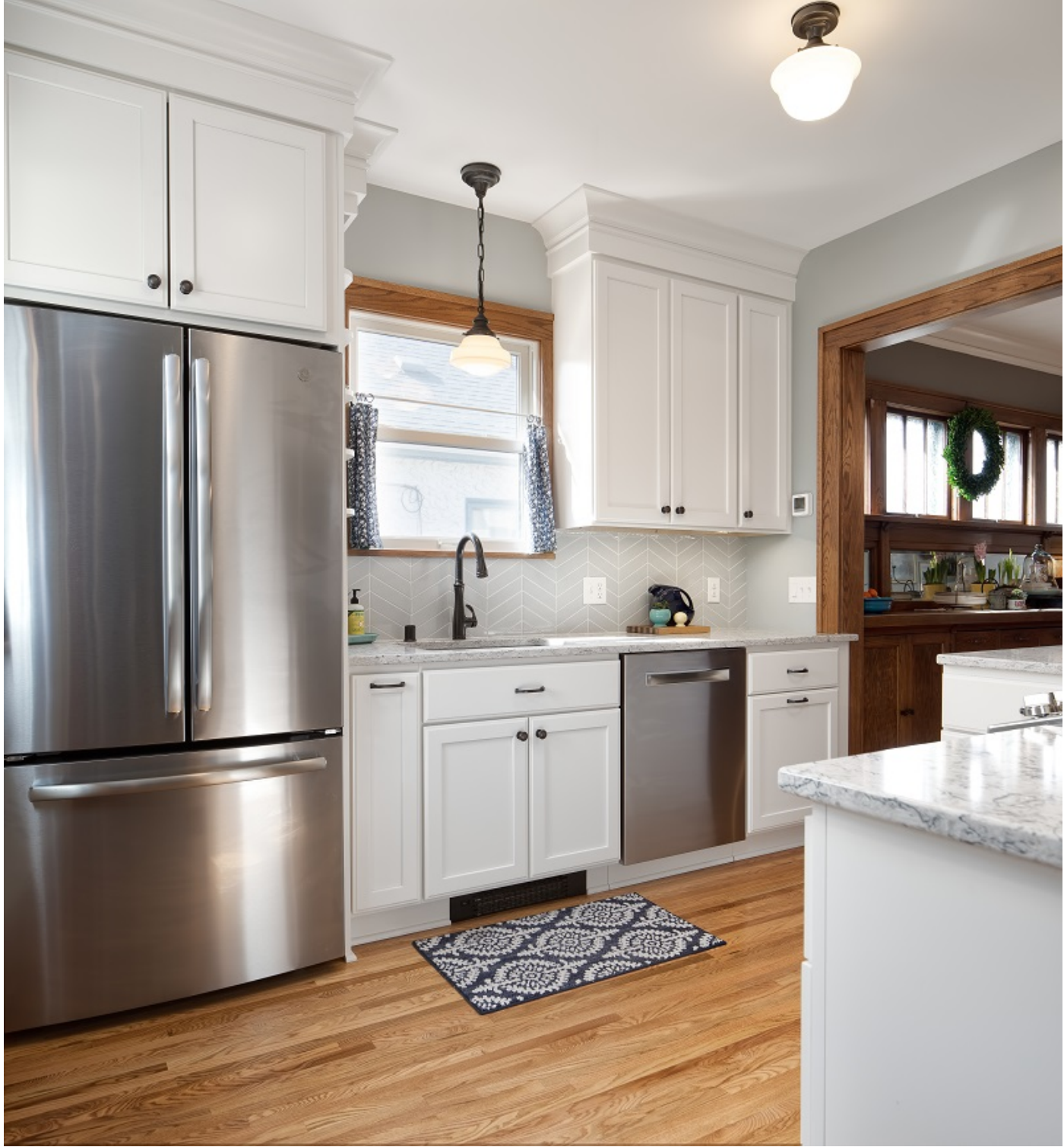
One of our favorite details in the glass-doored pantry for the homeowners to showcase their Fiestaware!