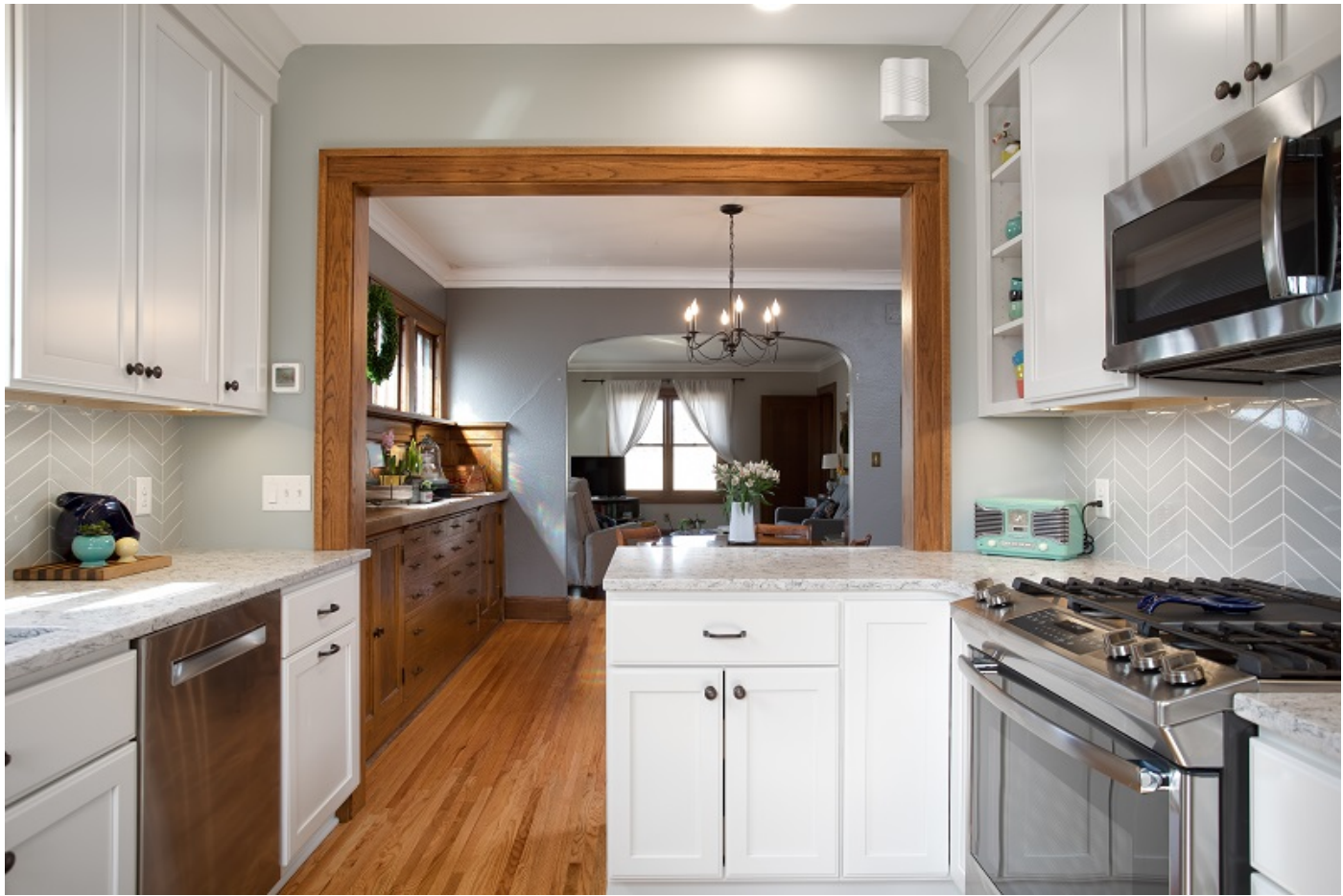
A new kitchen was designed that opened up to the dining room, to create more light and sense of space.

the home, and the kitchen was a challenge for the family.