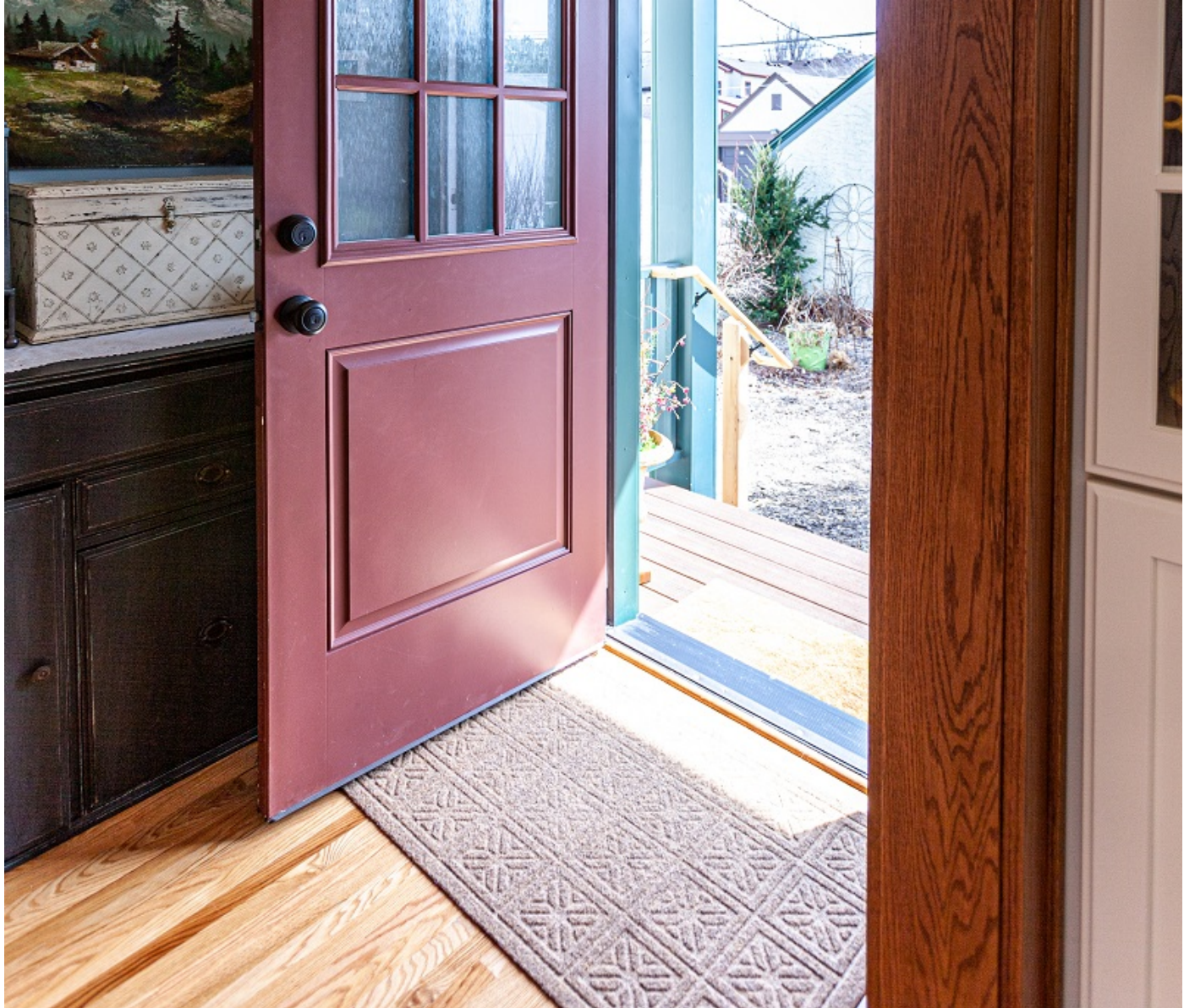
Castle designed and constructed a new open back porch with Azek composite decking, new railing, and stunning arch detail on the roof to coordinate with the home's existing sweeping lines.