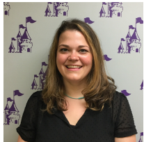
Designed by: Emily Blonigen

See full details, including before photos at https://www.castlebri.com/kitchens/project-3435-1/