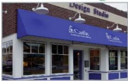
5 W. Diamond Lake Rd Minneapolis, MN 55419 P) 612-789-8509