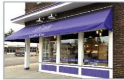
362 Snelling Ave S.