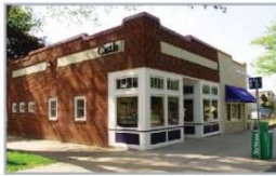
2600 Johnson St. NE