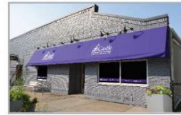
4020 Minnehaha Ave