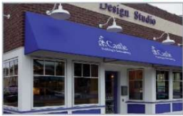
5 W. Diamond Lake Rd