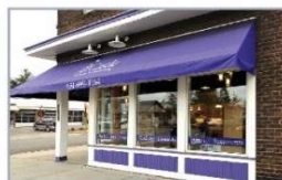
362 Snelling Ave S.