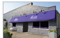
4020 Minnehaha Ave