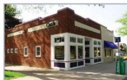
2600 Johnson St. NE