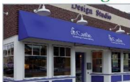
5 W. Diamond Lake Rd