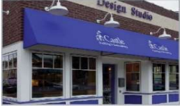
5 W. Diamond Lake Rd Minneapolis, MN 55419 P) 612-789-8509